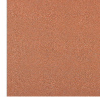
Copper Mine - 27 (COM)