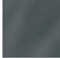
Gun Metal - 25 (GUM)